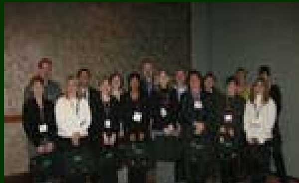
First Time Attendees